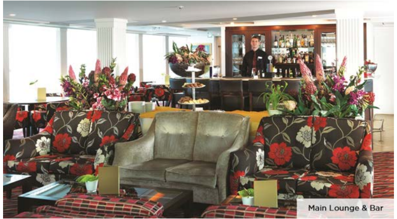
Main Lounge & Bar