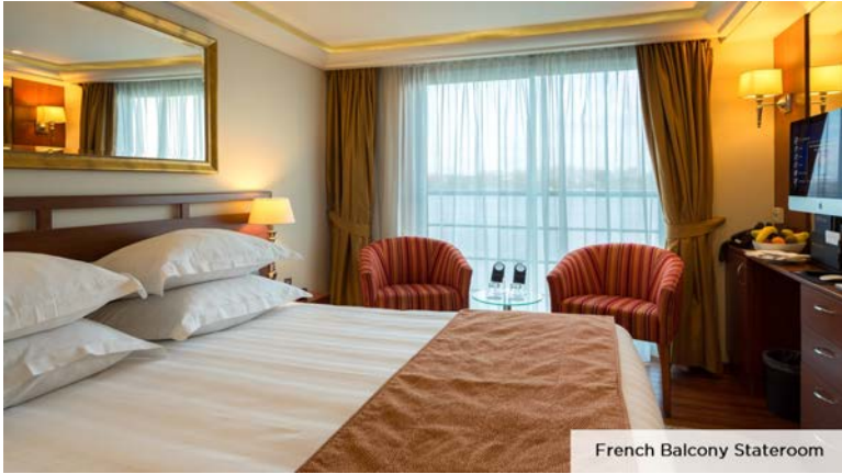
French Balcony Stateroom

7-night cruise | September 14-21, 2023 | Aboard AmaDolce